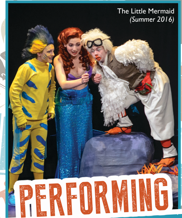
The Little Mermaid (Summer 2016)